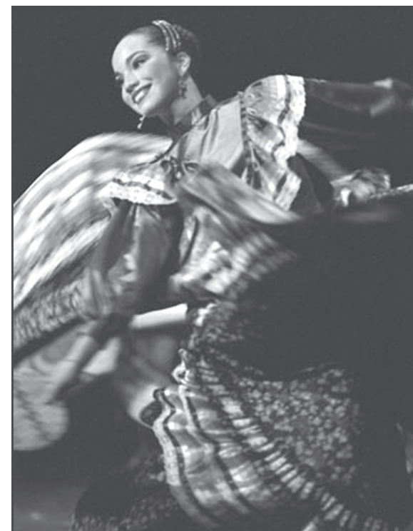
Whirling colors — Quetzalli: Ballet Folklórico de Veracruz will perform as part of the Artswego series at 7 p.m. Saturday in Tyler Hall's Waterman Theatre. The Mexican dancers will also meet with students, provide a lecture/demonstration of their work and present a program for migrant workers during their residency in Oswego. For tickets to the main performance, call 312-2141.

Campus and community members are invited to attend both admission-free events. □