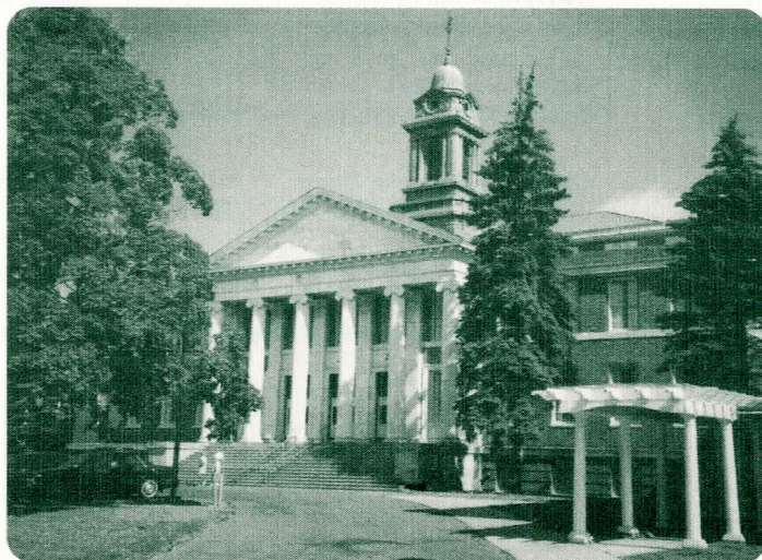
Sheldon Hall, the historic home of Oswego State, was first opened in 1913. It is named after Edward Austin Sheldon, who founded the college in 1861.